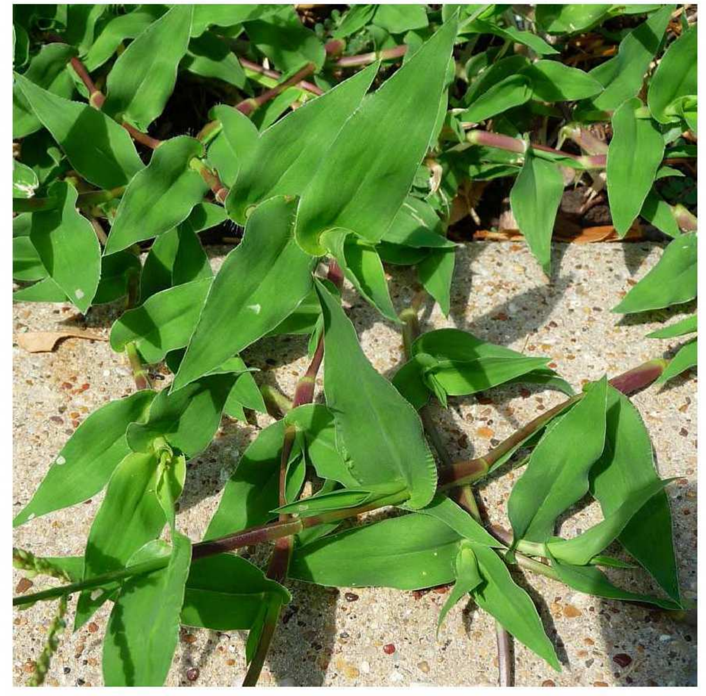
Figure 2. Above.